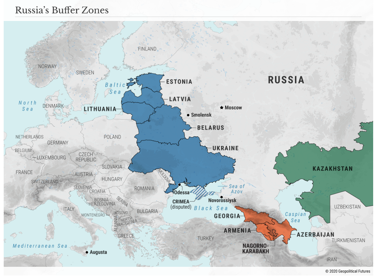
(click to enlarge)

Of late, Moscow has used a combination of economic cooperation and military involvement (in the form of its peacekeeping operation in Nagorno-Karabakh) to maintain its foothold in the Caucasus. But considering its deepening economic problems and assortment of other priorities, Russia's ability to compete for economic influence here is weakening. For example, it accounts for only 5 percent of Azerbaijani exports, while Italy and Turkey (both NATO countries) account for 30 percent and 18 percent, respectively. Baku is also increasing military cooperation with Turkey, which supported Azerbaijan in the 2020 war in Nagorno-Karabakh.